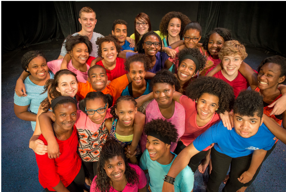
Students from Penumbra Theatre's Summer Institute, a leadership development program that trains teenagers to use their passion for the arts to promote social justice and equity.